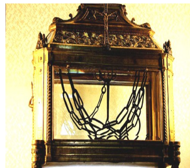
Reliquary of St. Peter's Chains located in Church of St. Peter in Chains, Rome, Italy

With one of his companions, Francis hastened to Pope Honorius III and prostrate implored him to proclaim that every one visiting the church and confessing their sins with a contrite heart would be as pure from all sin and punishments as he was immediately after baptism. The Pope granted this petition. This indulgence as been extended to all parish churches throughout the world.