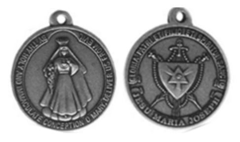
Medal of Our Lady of America with the "Eye of God" cast by Archbishop Leibold